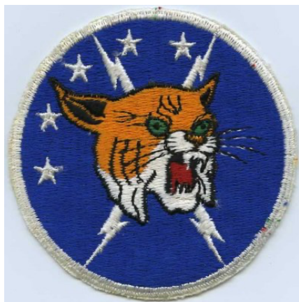
5 Fighter Interceptor Squadron emblem: approved, 16 Jan 1951